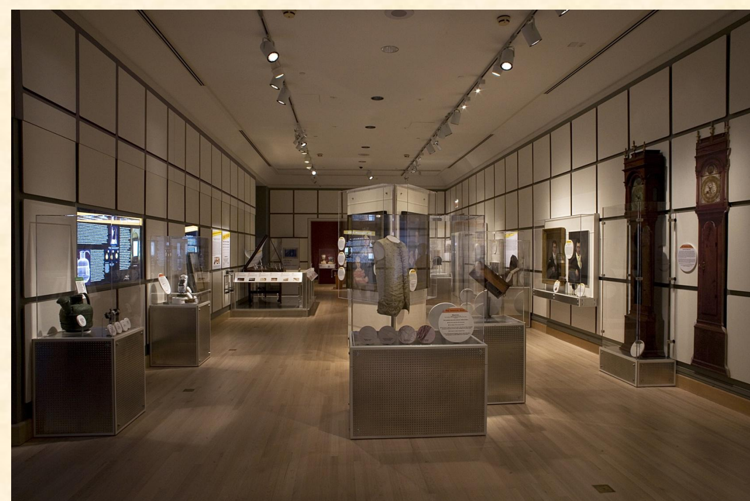
Figure 7: Overview of the exhibit