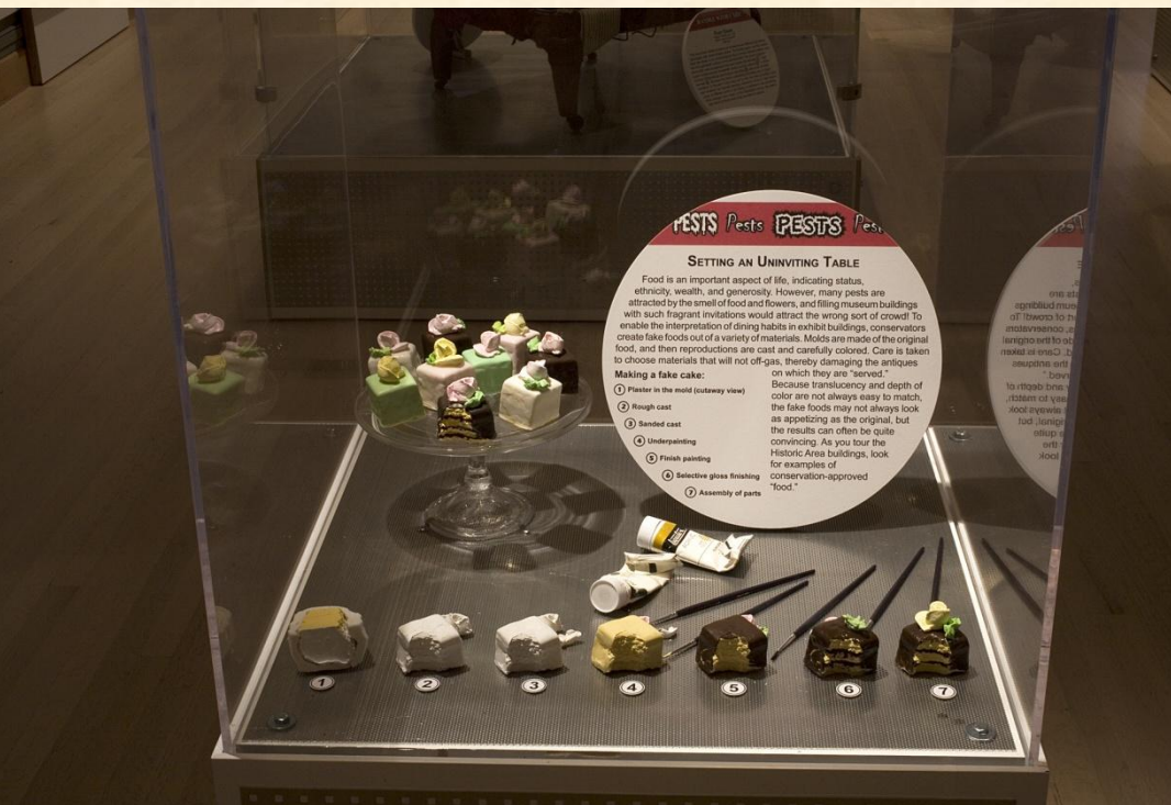
Figure 5: Fabricating Fake Food

As a field, conservation has a well-developed visual language that includes before and after images, magnified views of objects' surfaces and, a perennial favorite, the conservator peering through the microscope (Figure 1). These images have strong visual appeal, are widely recognized and are often used, by those outside the field, to illustrate content that may have little to do with the activities at hand. Meanwhile, conservation has struggled to develop a recognizable vocabulary linguistically, which poses problems for outreach. Recently, Colonial Williamsburg's Department of Conservation engaged in two large-scale, high profile public outreach activities: an electronic field trip entitled Treasure Keepers (Figure 2) and a conservation exhibit called Conservation: Where Art and Science Meet . (Figure 3). Both projects required intense interdepartmental collaboration; neither could have been realized without the aid of a number of individuals in departments across the foundation. However, this very fact highlighted some of the linguistic challenges facing conservators engaging in outreach.