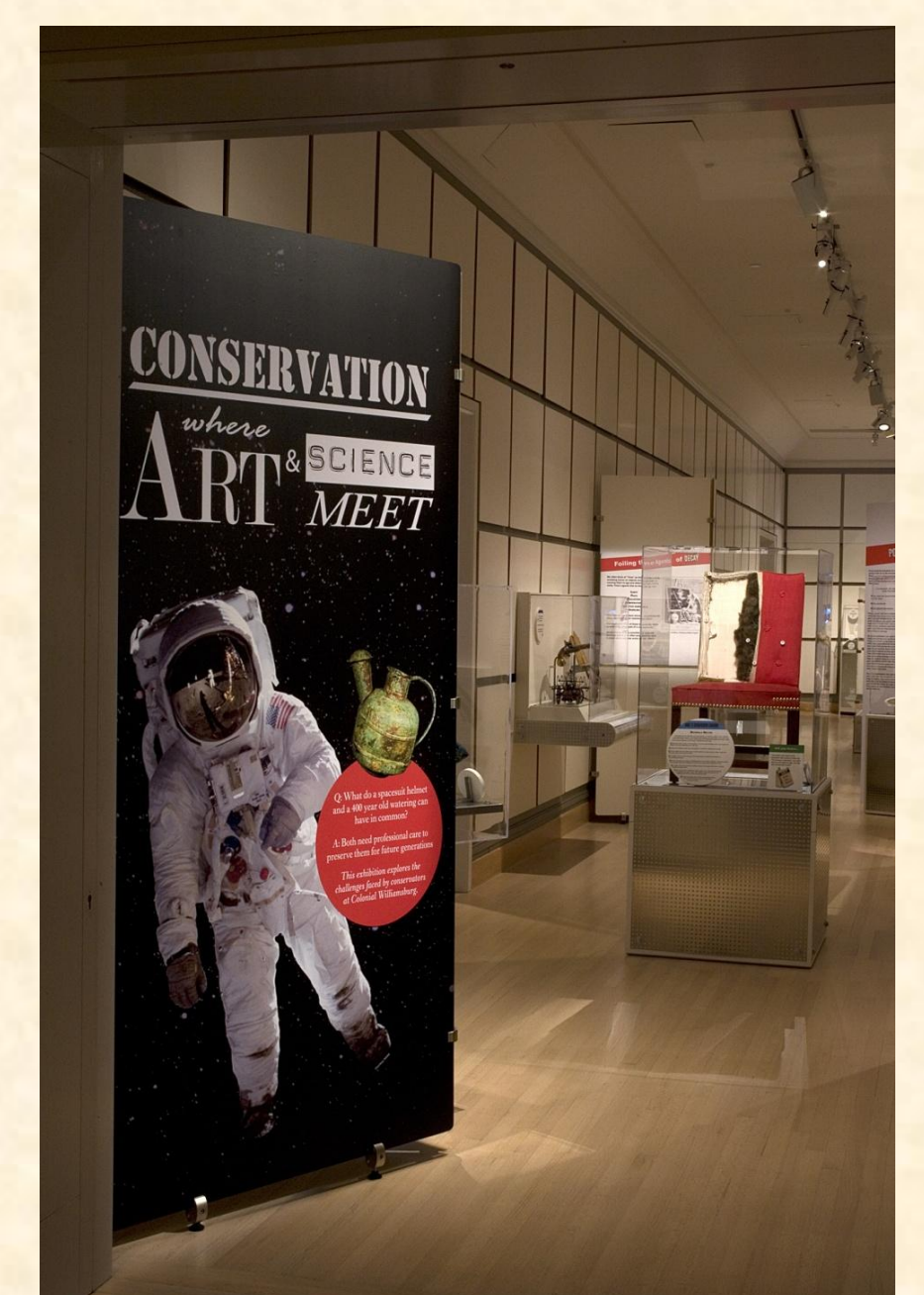
Figure 3: Entry to Conservation: Where Art and Science Meet