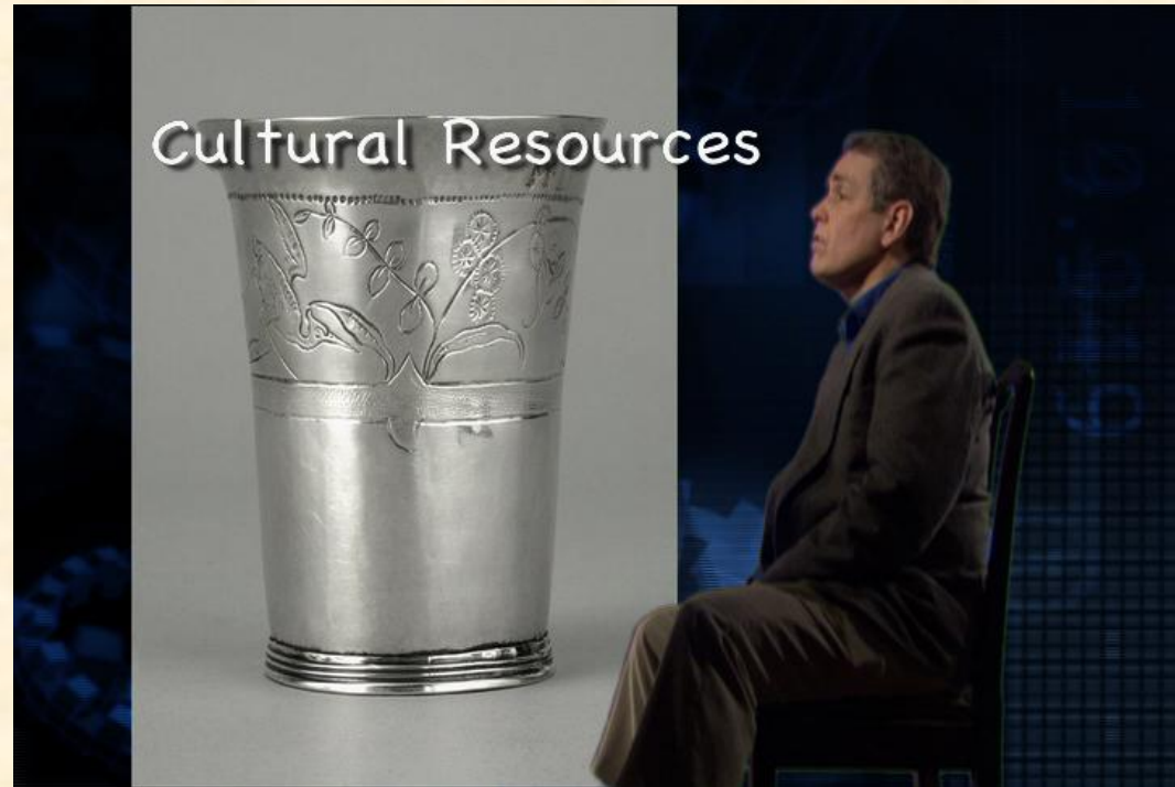
Figure 4: Conservator interviews