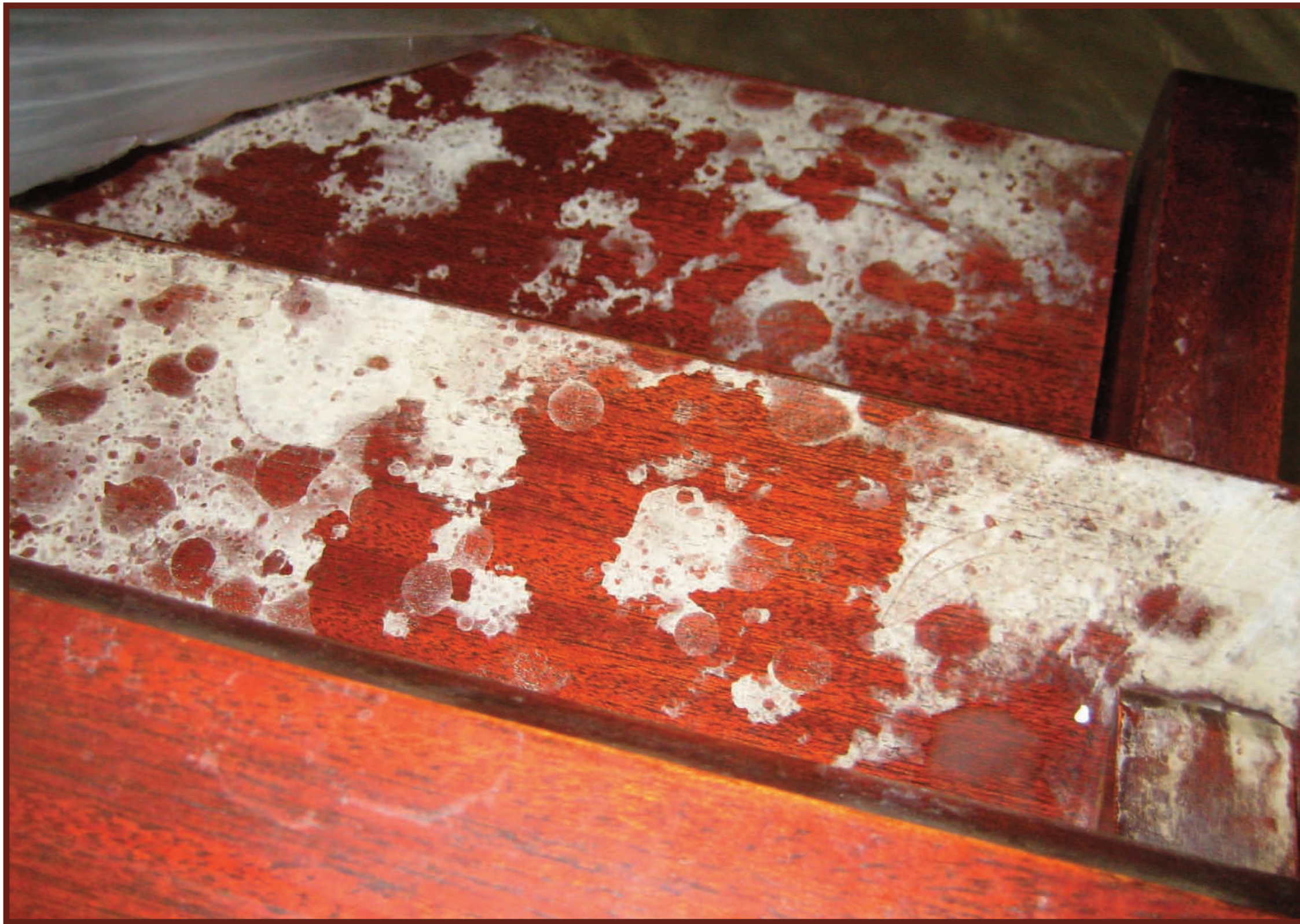
After water damage

This poster presents the method used to repair the water damage and the restoration of the original finish of a mid-20th century mahogany spinet piano.