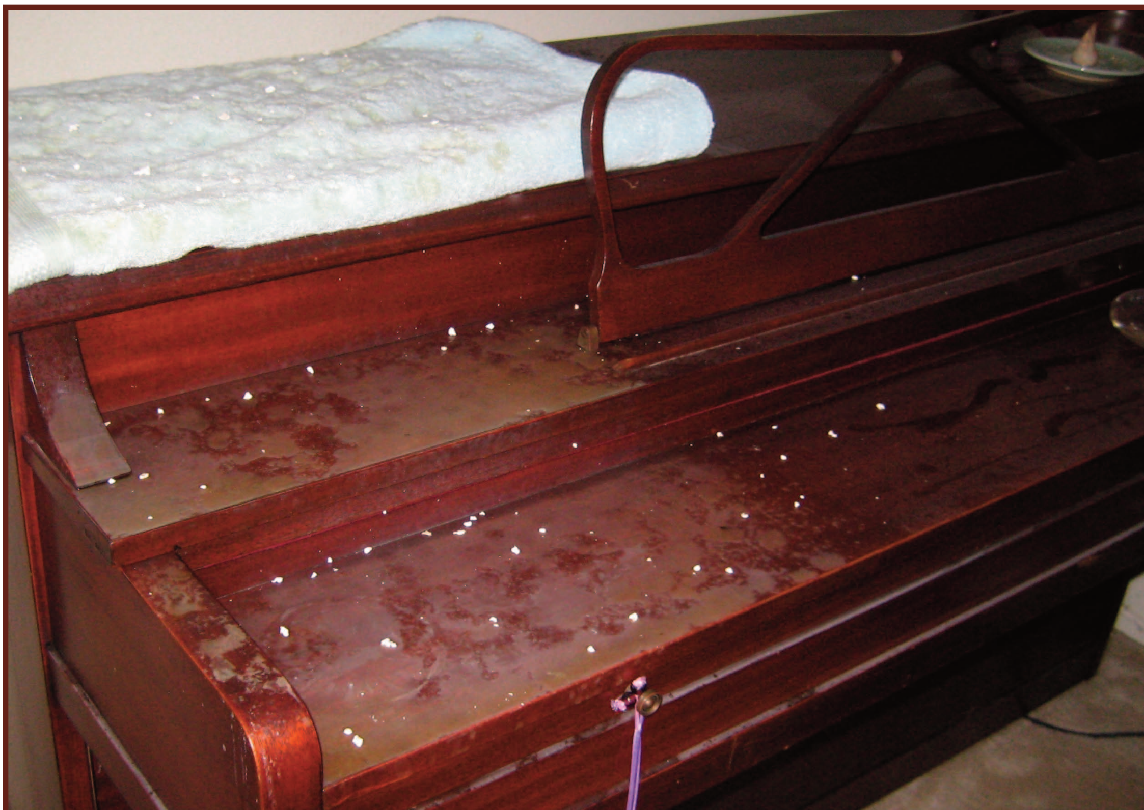
After applications of mayonnaise over 2 wks

Restoration of the surface veneer was accomplished in two weeks' time using the following methods: