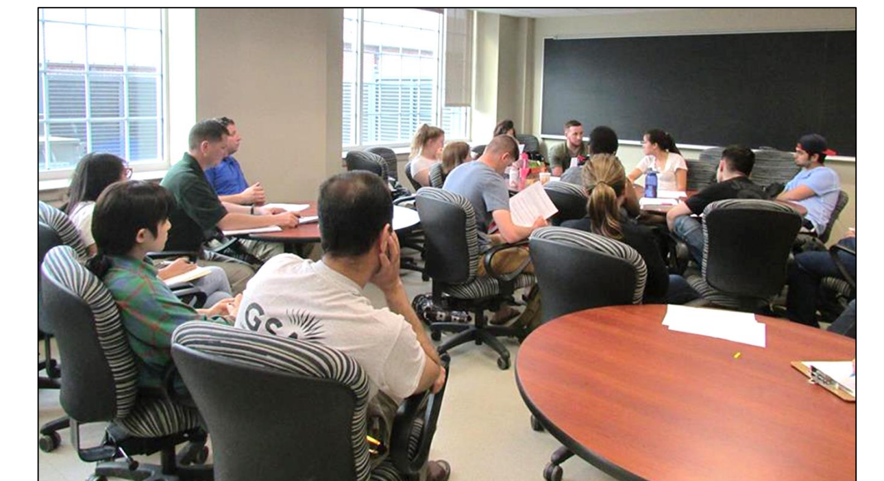
A tabletop exercise run by UD graduate students during an undergraduate level seminar.