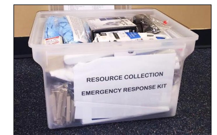
The Emergency Response Kit for the Disaster Research Center's resource collection.