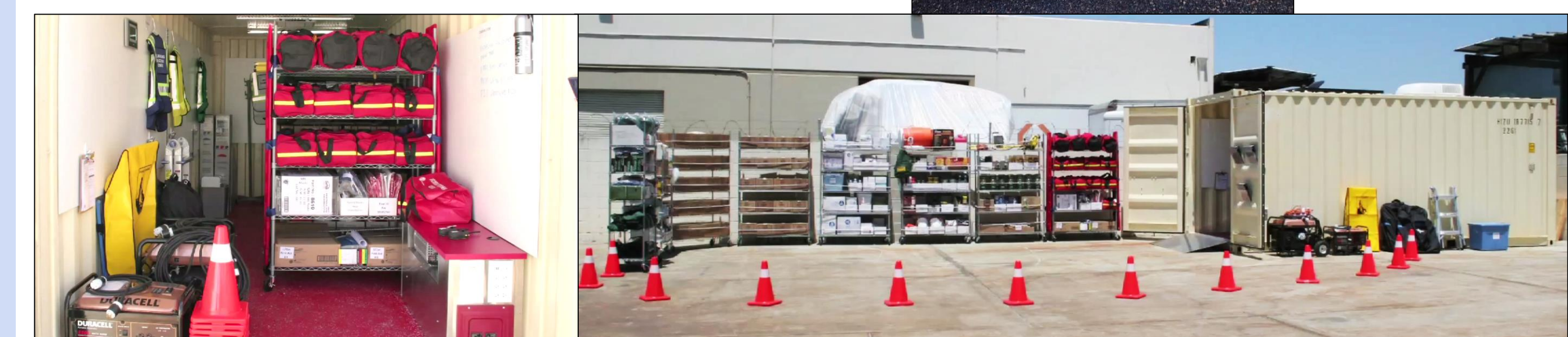
Examples of Emergency Supplies containers.