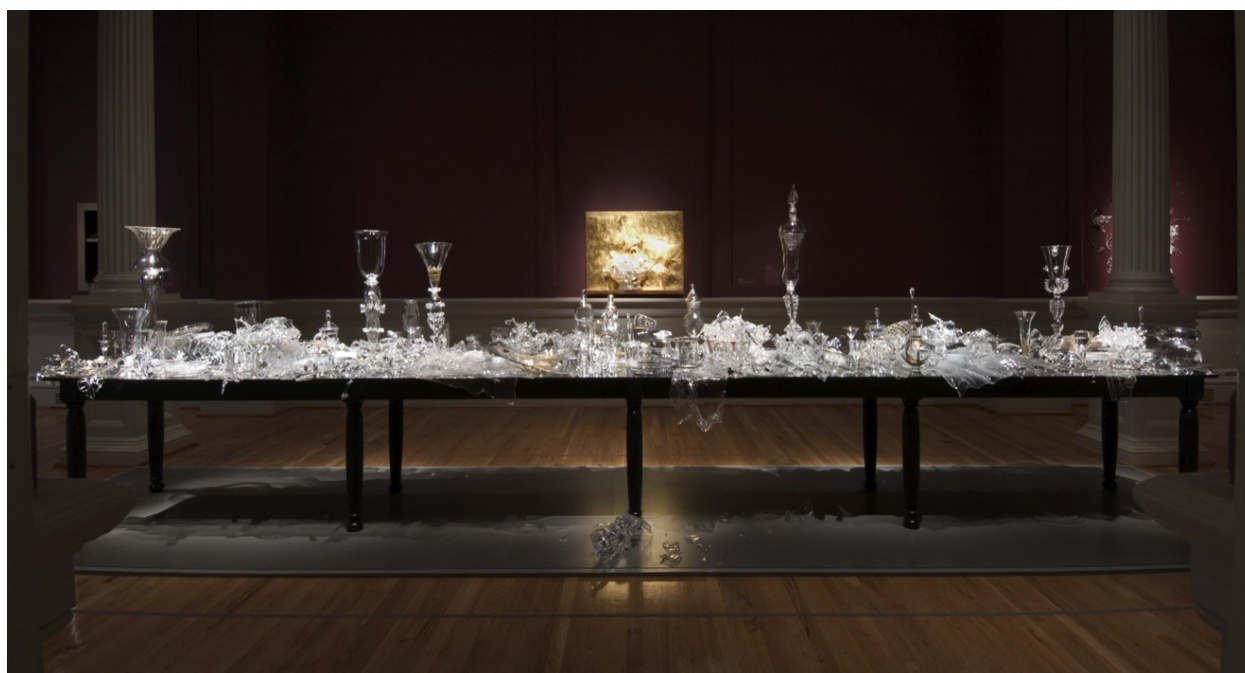
Fig. 8. Final installation of Bancketje for the Renwick Gallery's exhibition of From the Ground Up: Renwick Craft Invitational 2007