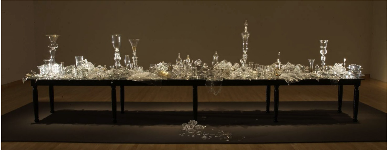
Fig. 1. Bancketje (Banquet) , 2003. Gallery installation photograph from the Museum of Glass Tacoma, Washington

As a glass artist, Lipman's working process is by necessity collaborative (fig. 2). She has taken the idea of collaboration further by actively soliciting other artists to contribute objects made by their hand, not hers, for inclusion in the final assembled work. Additionally, for her larger compositions, Lipman actively seeks the input of volunteers and assistants with the installation and final arrangement of her large works. This collaborative spirit can result in a virtually "new" installation of a sculptural work at each new venue.