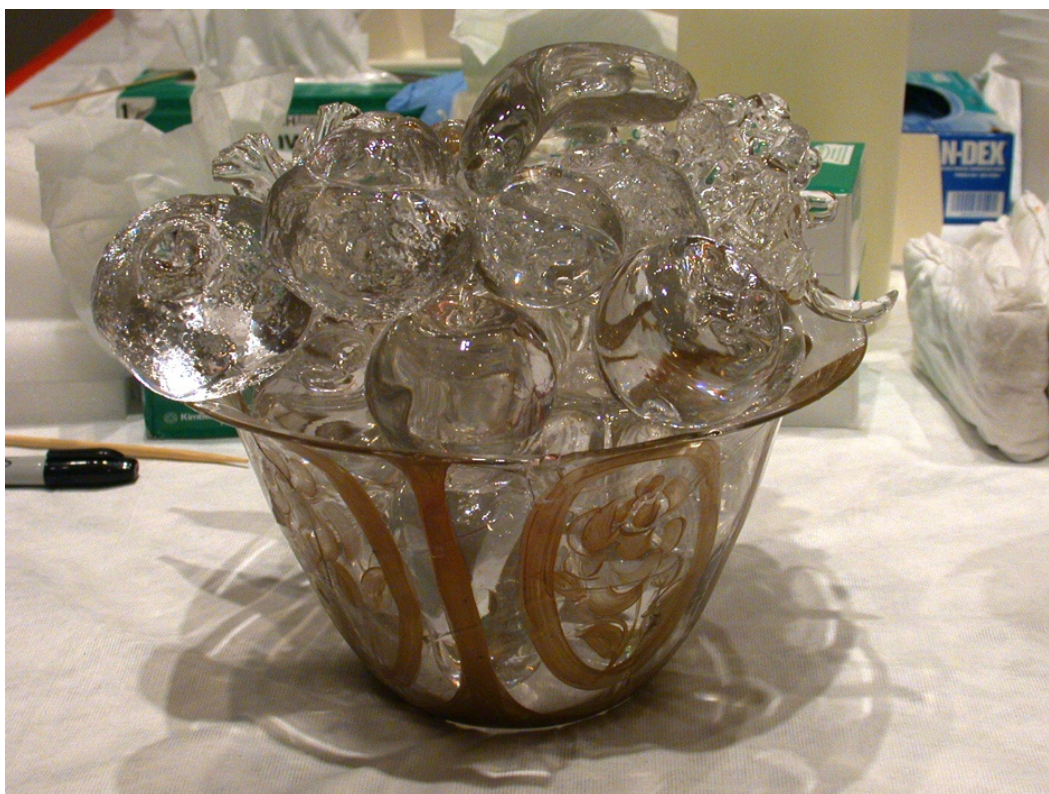
Fig. 5. Component from Bancketje showing applied gold craft paint, artist's repair to bowl, and individual glass fruit epoxied into the bowl requiring cleaning as an individual unit