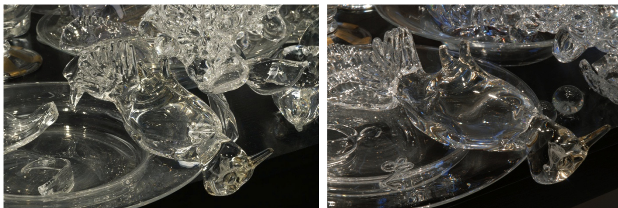
Fig. 6. Bancketje elements before and after cleaning. Left image: Before treatment condition at previous venue showing cloudiness of the glass. Right image: After treatment on exhibit at the Renwick Gallery with no visible cloudiness of glass