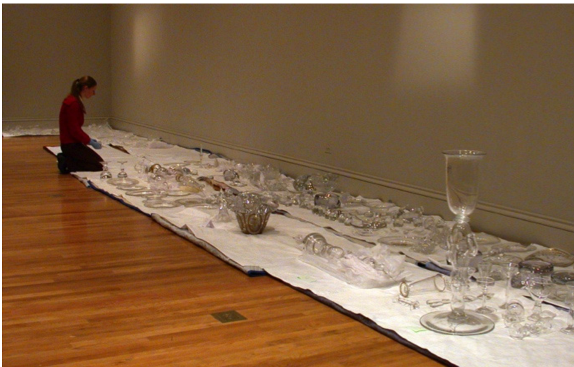
Fig. 4. Conservator Rachel Penniman reviewing a small portion of the components during unpacking by the Registration staff