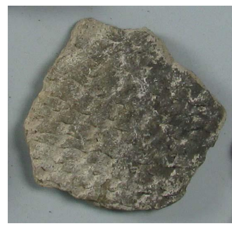
Reserve indented corrugated sherd