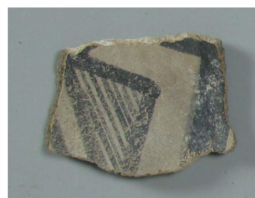
Gila polychrome sherd