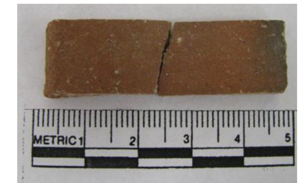
Gila plain sample after 1 month of accelerated aging (left) and after two months (right). The only noticeable difference is the presence of a white efflorescence on the surface after two months. No damage or crumbling of the surface visible.