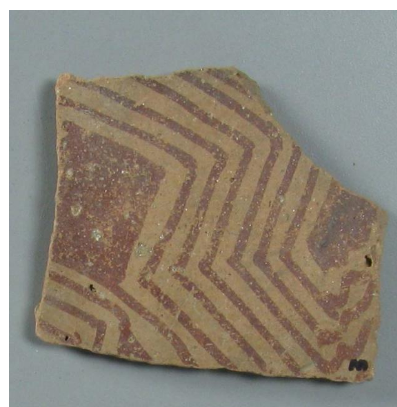
Santa Cruz red-on-buff sherd