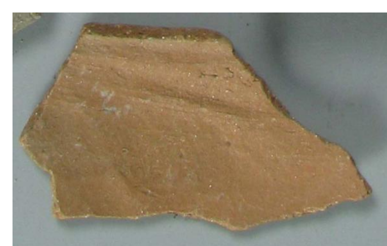
Gila plain sherd

2) Sample selection: The analysis of the data collected during the survey showed a certain pattern in the presence and appearance of salt damage. A set of Southwestern ceramics representative of the ones with the highest levels of salt damage in the collection of the Arizona State Museum was selected for a study of their material properties and how they relate to degrees of observable damage. Four samples were selected: 2 Hohokam types (Gila plain and Santa Cruz red-on-buff), 1 Salado type (Gila polychrome) and 1 Mogollon type (Reserve indented corrugated).