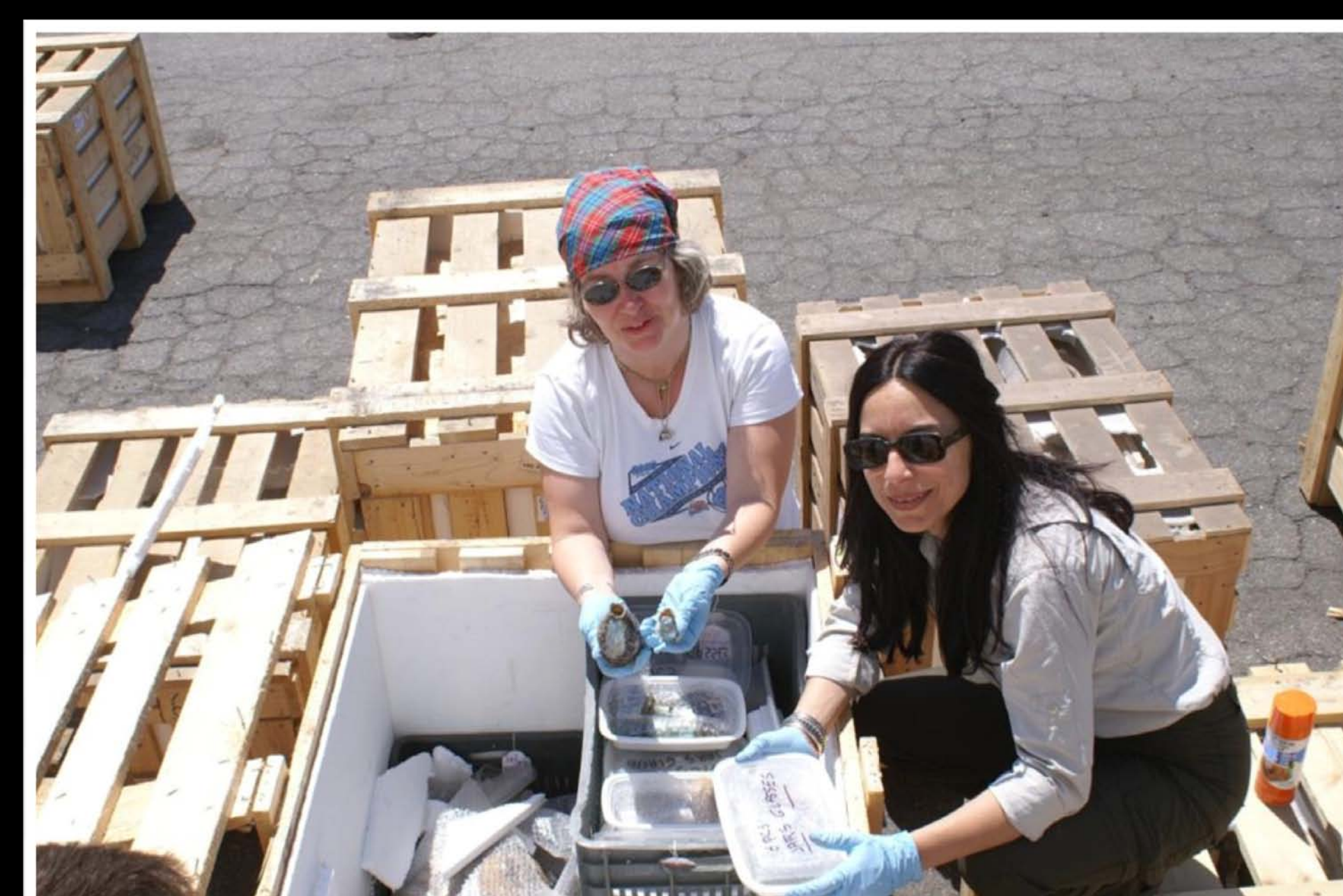
Expert assistance with identification and technical study of illicitly imported artifacts seized by DHS-ICE agents