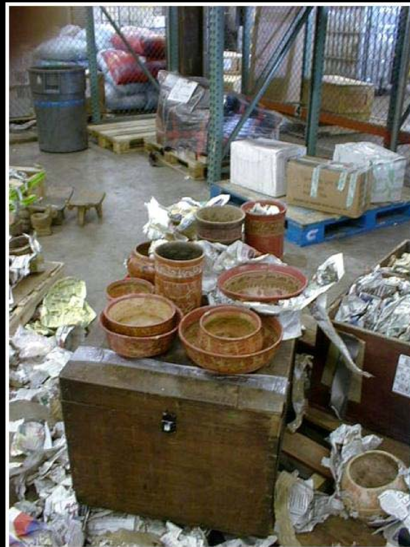
Artifacts detained by DHS-ICE agents for investigation