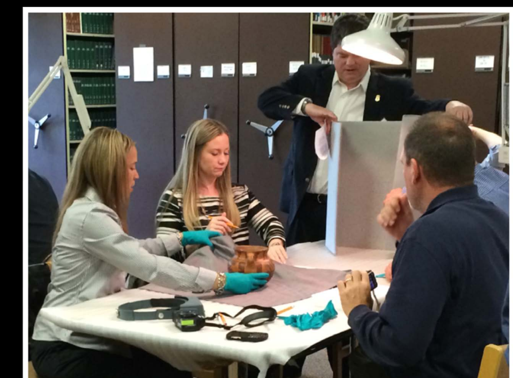
Below: Practicum session on case investigation procedures using collection items from the Smithsonian’s National Museum of Natural History