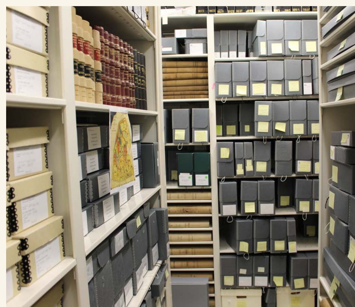
Fig. 1. Mount Auburn Cemetery, Collections Storage, 2019

The Cemetery's Historical Collections & Archives represents over 3,500 linear feet of material and holds information related to individuals who are buried, cremated, and remembered at Mount Auburn, as well as important records relating to early landscape architecture and design, horticulture, commemoration, and land conservation. Presently the Collections team is made up of a full-time curator, four consultants, and six volunteers, while Mount Auburn Cemetery has approximately 50 year-round staff members and an additional 50 seasonal staff.