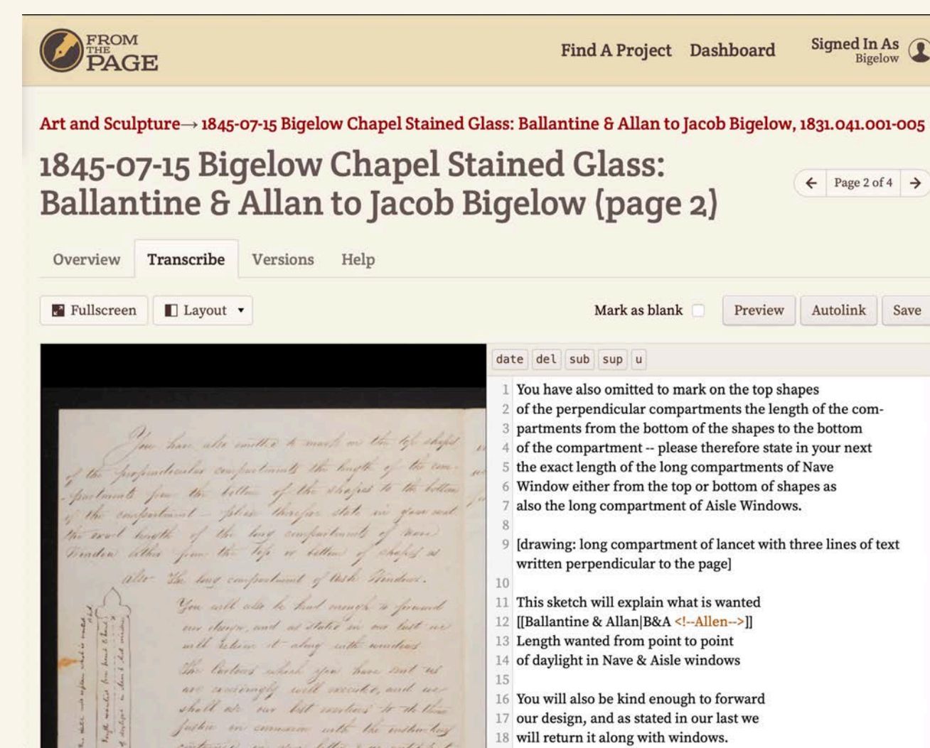
Fig. 2. Screenshot of Transcribing Mount Auburn , 2021