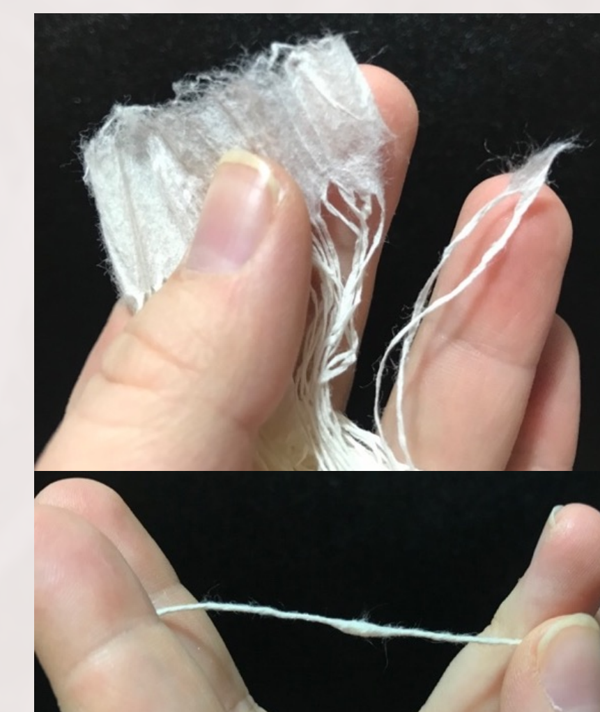
Figure 4: Joining threads

The strips are joined in one continuous thread by tearing a small tab of paper from the connecting strip above two threads. This tab is rolled in the same direction you intend to spin the thread creating the "seed". This seed is one of the most notable characteristics of paper thread, and forms a unique pattern in the final woven cloth.