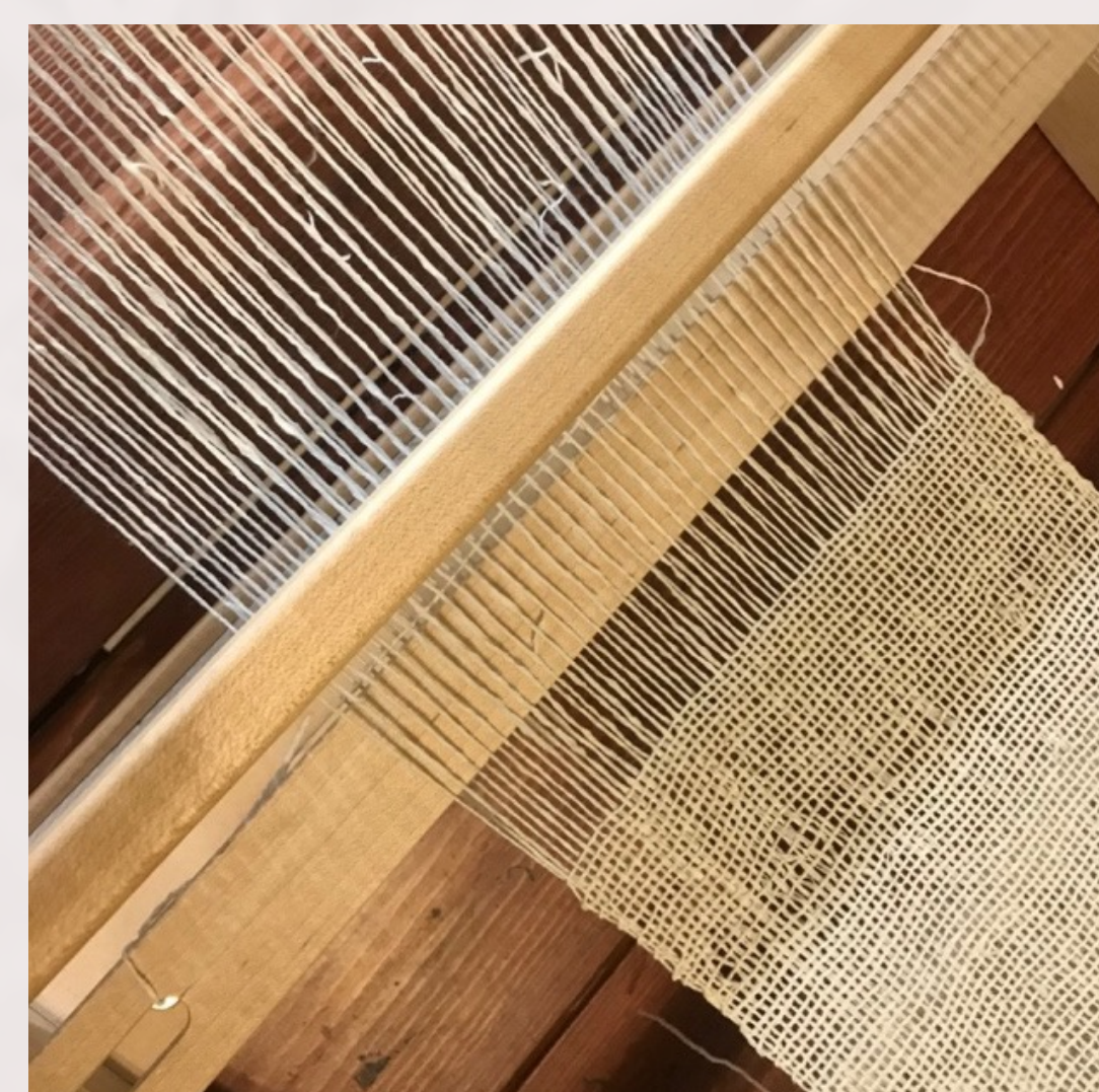
Figure 7: Weaving with paper warp and weft

Historically, a floor loom was used for weaving kami-ito , sometimes with a cotton or silk warp. For this project a Cricket loom was used. Samples of cotton warp with paper weft, and paper warp and weft were made. A plain weave was used for all samples, varying the spacing of the warp threads to create a pattern.