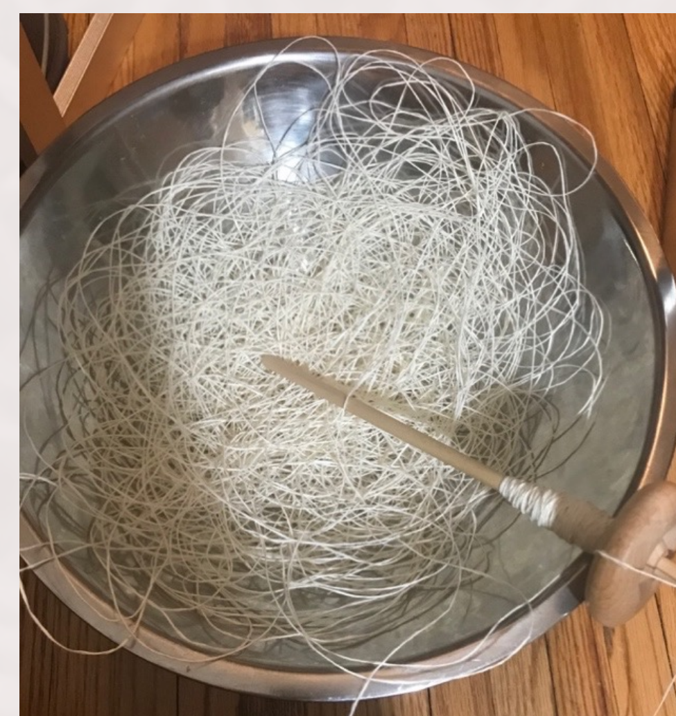
Figure 5: Spinning thread