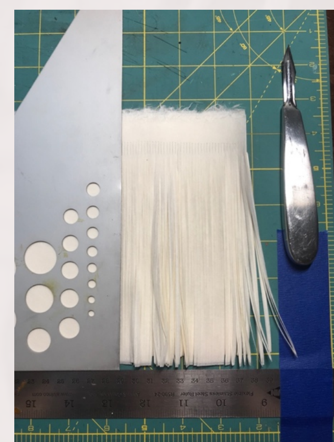
Figure 1: Cutting strips (2mm width)