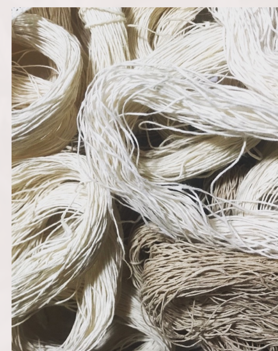
Figure 6: Spun threads ready for weaving

Spinning is usually done with a Japanese spinning wheel to achieve a tight twist, but a lightweight drop spindle can be used. The resulting thread is slightly airier and weaker due to the looser twist. After spinning, the thread is wound on bamboo spindles and boiled or steamed to set the twist.