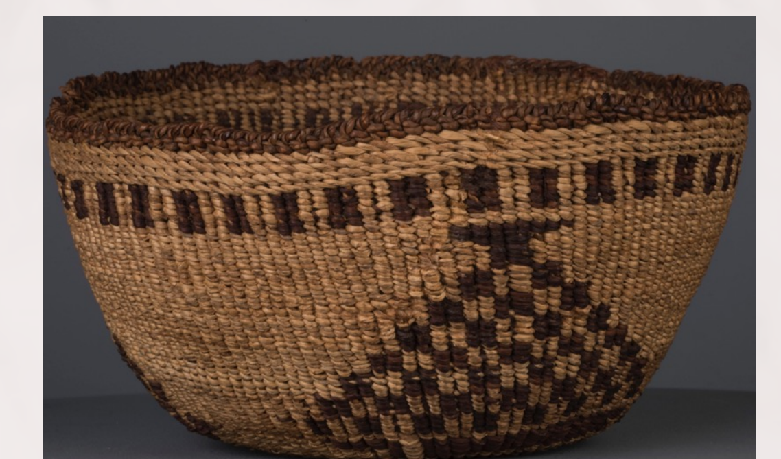
Figure 16: Side B after treatment