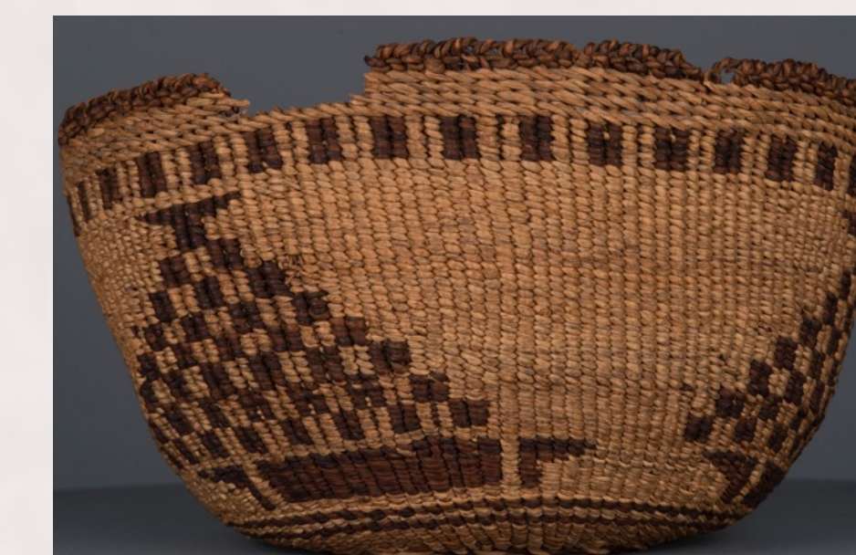
Figure 9: Side A before treatment

THE OBJECT: A woven basketry cap from the Hupa Nation of American Indians. The hat is woven from bast and root fibers. The main structural issues are two areas of loss, and an area of tears (Figure 10).