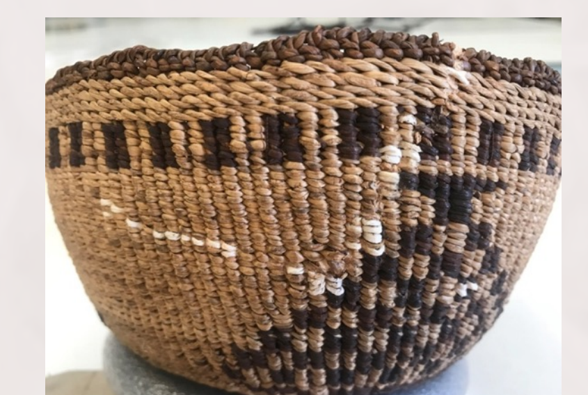
Figure 12: Before toning