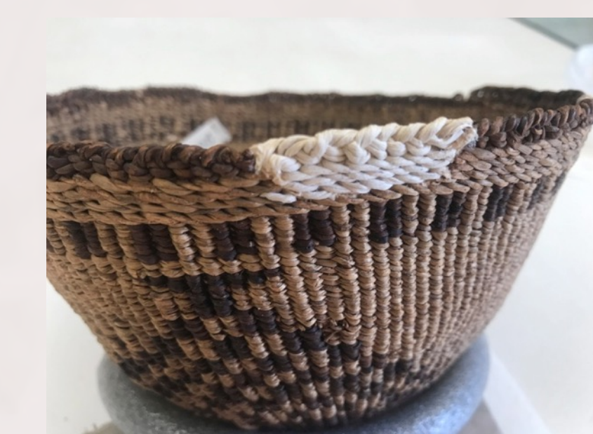
Figure 14: Fill before toning