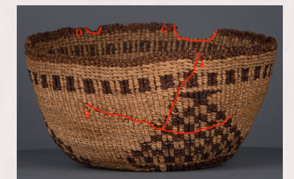
Figure 10: Side B before treatment, mapped losses

TREATMENT: The tears and losses were repaired with kami-ito made from 50/50 mitsumata and gampi paper. This fiber combination best matched the surface characteristics of the hat fibers. The thread was spun loosely to match the striations of the bast fibers in the hat. The fill was woven in the same manner as the original. All repairs were set in place with wheat starch paste and toned with acrylics.