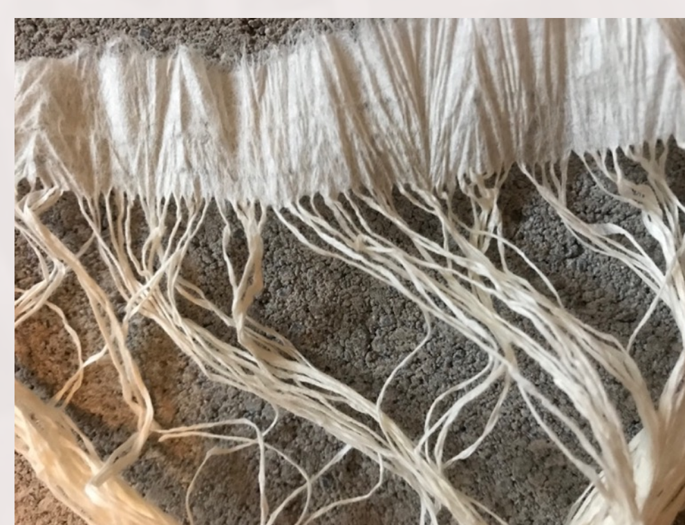
Figure 3: Detail showing U shape between threads