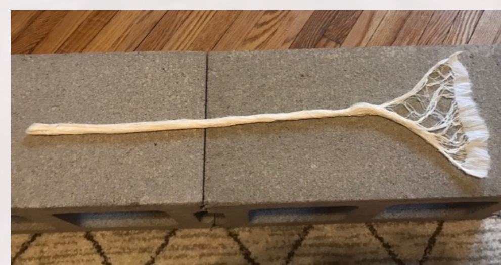
Figure 2: Rolling one bundle

The cut sheets are humidified, then rolled on sanded smooth concrete blocks. The rolling begins in the center of the section, gradually moving to the ends. The rolled bundle is periodically shaken from alternate ends to discourage entanglement. The rolling continues until the strips pull apart from each other, forming a slight U shape where they are joined by the inch of paper left during cutting.