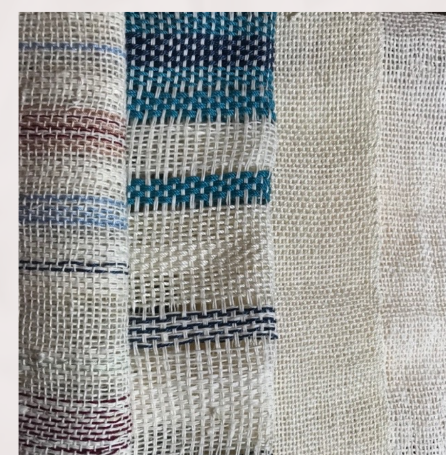
Figure 8: Weaving samples