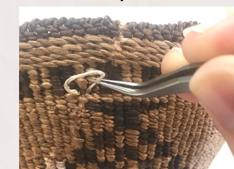
Figure 11: Tear repair with kami-ito

TREATMENT: The tears and losses were repaired with kami-ito made from 50/50 mitsumata and gampi paper. This fiber combination best matched the surface characteristics of the hat fibers. The thread was spun loosely to match the striations of the bast fibers in the hat. The fill was woven in the same manner as the original. All repairs were set in place with wheat starch paste and toned with acrylics.