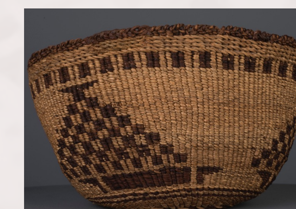
Figure 15: Side A after treatment