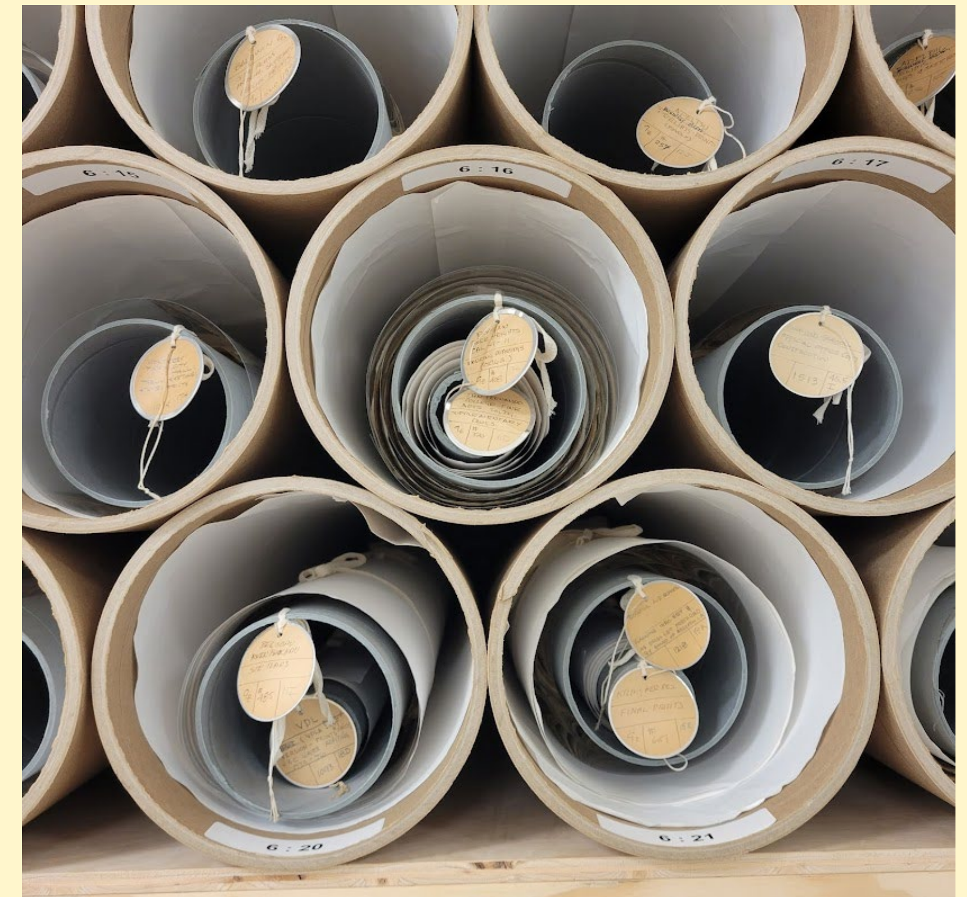
Figure 5. Close-up showing 2" diameter storage tubes in 4.5" diameter storage tubes in 8" diameter structural tubes. The 8" structural tubes are made out of kraft paper (non-archival), to cut down on costs, and then lined with blotter to prevent acid migration.

The 2" diameter tubes were put inside the 4.5" tubes, which doubled the storage capacity of the new structure without requiring more space. The items on the smaller rolls are still supported with a curved surface, to prevent flattening on the bottom of the roll. The rolls can be removed from the structure together or separately, taking out the small and then the large, which keeps the materials easily accessible. In re-rolling the items with clean and supportive materials and re-imagining old and new storage spaces, this rehousing has provided stability and thus longevity to the collection.