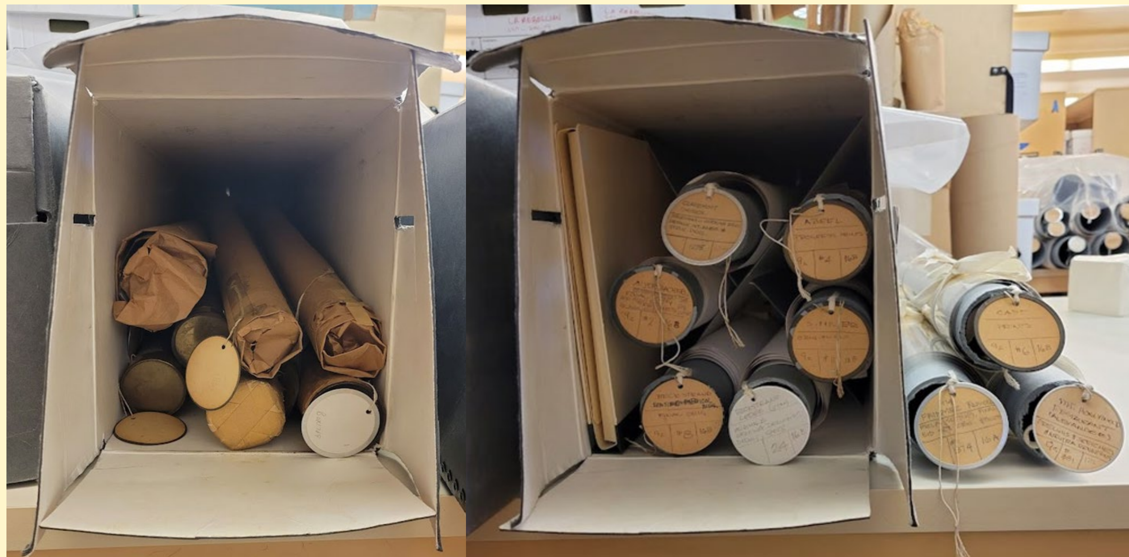
Figure 1. Left image: before rehousing. Right image: after rehousing, three rolls no longer fit in original box.

In 1998 UCLA Library received an accrual to Richard Neutra's collection, and to quickly process the 1,410 individual rolls of architectural materials they were rolled as tightly as possible, covered with kraft paper, and packed into 207 boxes. Neutra was a prominent modernist architect who lived and predominately worked in Los Angeles from 1925 to his death in 1970. His buildings and influence can still be seen throughout Los Angeles, thus his work is often requested for viewing and research. However, the current storage system was not recommended for the collection's stability or access.