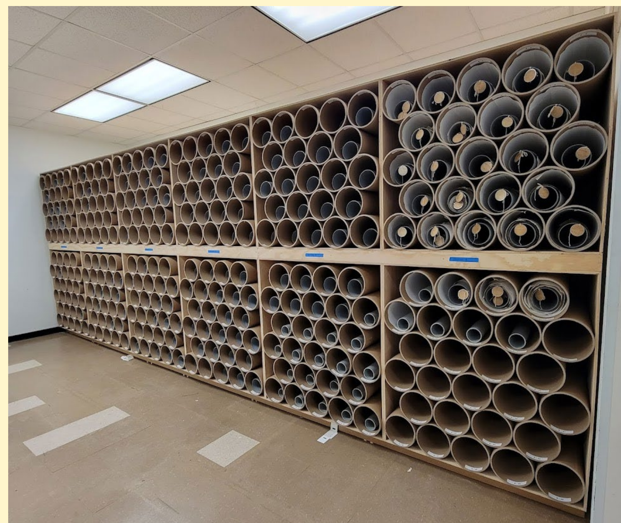
Figure 3. Constructed rolled storage structure.