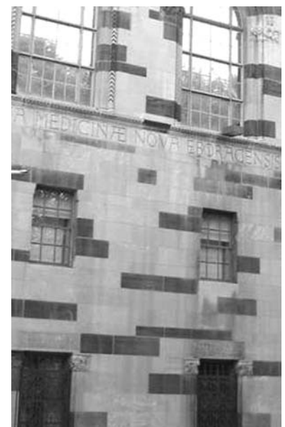
Figure 3: NY Academy of Medicine, constructed of limestone and sandstone. Note soiled sandstone.

The different components of soiling associated with carbonate and silicate substrates, and the relative tenacity with which they are attached, influences their ability to be removed and, therefore, the relative risk associated with cleaning. The water solubility of gypsum, which is the source of its ability to cause deterioration, also allows for its removal by water alone—usually with misting devices. Water alone is