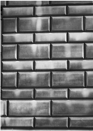
Figure 4: Columbia University School of Journalism Building, soiled limestone.

ineffective for cleaning sandstone. Other methods, such as chemical cleaning—using acids, bases, alone or in combination, and particulate or abrasive cleaning—using mineral or glass particles delivered under pressure, are generally considered to carry greater risk of damage to stone substrates than water misting.