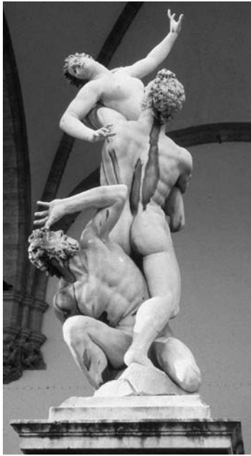
Figure 1: Giambologna, "Rape of the Sabines," before cleaning.

sculpture (or architectural fragments and larger sets of building elements) generally present a more consistent pattern of soiling than sculpture, monuments, and buildings outdoors. Indoors, high points, projections, and up facing surfaces tend to soil more and become darker than recesses and this preferential soiling can create a garish and confusing appearance.