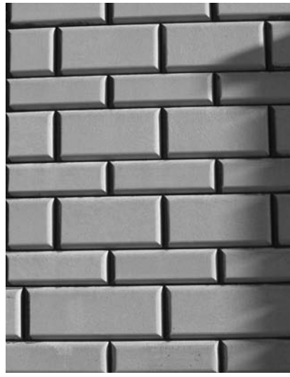
Figure 5: Columbia University School of Journalism Building, unsoiled limestone.

Both chemical and abrasive methods have advanced considerably in the last 25 years. The term most commonly used for abrasive cleaning prior to about 1980 was sand blasting . The widespread use or misuse of the technique led to a ban on abrasive cleaning by the Department of the Interior for its historic properties. At that time, the words sand and blasting were quite appropriate. The abrasive medium was sand—both in the geologist’s sense, i.e. a collection of mineral particles ranging in size from 0.06 to 2 millimeters (60 to 2000 micrometers), and, in our common sense, i.e. primarily particles of quartz beach sand. The particles were also “blasted” at stone surfaces at pressures ranging from hundreds to thousands of pounds per square inch (psi). The large size and relative hardness of the particles, and the high pressure of delivery allowed significant damage to occur during routine cleaning operations. Newer methods have employed much smaller (a softer) particles (typically 50 micrometers or less) and much lower pressures (60 psi or less). These improvements allow use with much lower risk, for cleaning not only sandstones, granites, schists, and gneisses, but