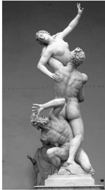
Figure 2: Giambologna, "Rape of the Sabines," after cleaning.

Differences in choice of building materials can also result in unintended visual effects. For example, the soiling of limestone and sandstone exposed outdoors is demonstrated to good effect on the New York Academy of Medicine, which is constructed of both light gray Indiana limestone and mottled, mustard