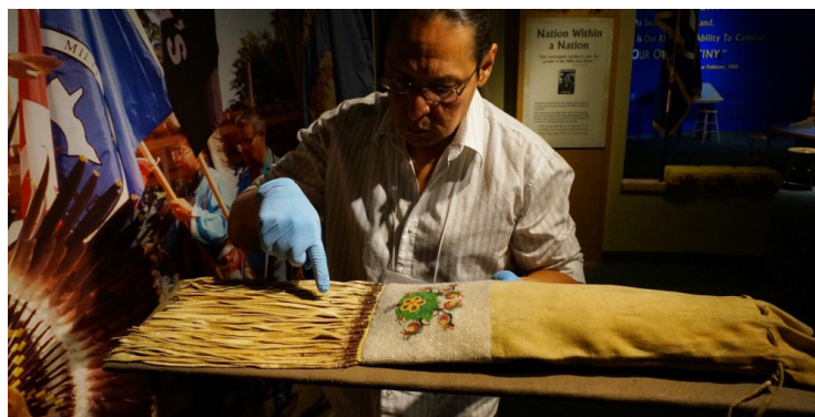
Collections Care Workshop at Mille Lacs Tribal Museum.

The AIC Code of Ethics and Guidelines for Practice states that "cultural property consists of individual objects, structures, or aggregate collections" ( www.conservation-us.org/code ). Anthropologists working with and for Indigenous communities, for example, have increasingly acknowledged that "material culture" (often referred to as tangible heritage) cannot be teased apart from intangible heritage (the deep cultural knowledge