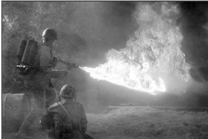
National Museum of the Pacific War - Living History Program

Most of the time, it happens by accident.