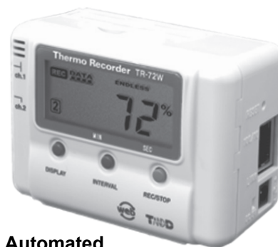
Automated Error-free Record Keeping