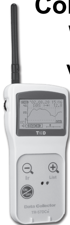
"Walk-By" Wireless Data Collector