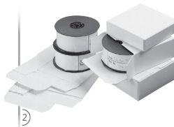
1 | Document Cases 2 | Microfilm Boxes 3 | Record Storage Cartons 4 | Envelopes

Take advantage of our expertise in preservation to fortify all of your historical records, newspapers, photographs and collections. We offer a broad range of quality materials and carefully crafted designs to suit your every need.