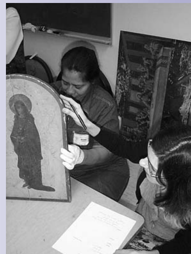
Members of the Louisiana Art Conservation Alliance (LACA) helped to catalog and re-house icons, books, textiles, and metal objects at Holy Trinity Greek Orthodox Cathedral in New Orleans, the oldest Greek Orthodox church in North and South America.