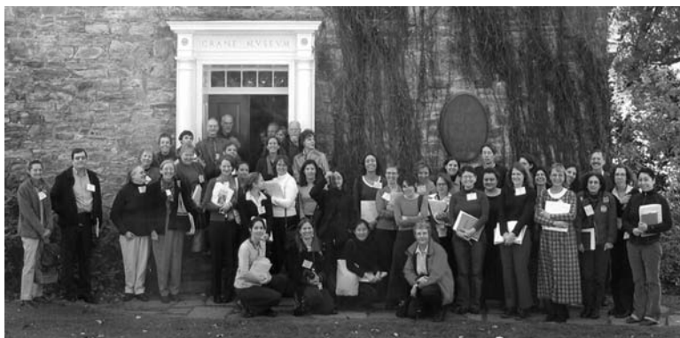
A busload (literally) of conservators participated in the AIC "Contemporary Machine-made Papermaking" workshop in Williamstown, Massachusetts.

Armed with a new wealth of information, we visited Esleeck Paper Mill and Crocker Paper Mill the following day. This provided a unique opportunity to observe and compare a Fourdrinier papermaking machine (Esleeck) and a Cylinder-mould machine (Crocker). We gained a better understanding of the design characteristics of each machine culminating in the production of distinctly different types of papers. At the Crocker Mill we were fascinated to see paper pulp distributed on a wire that ran upside-down. In the Esleeck Mill we marveled at their collection of over 100 dandy rolls.