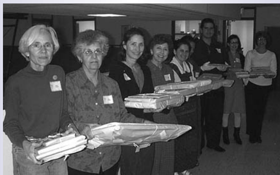
A "bucket brigade" of LACA and church members helps moved wrapped objects into safe storage at the Holy Trinity Greek Orthodox Cathedral.