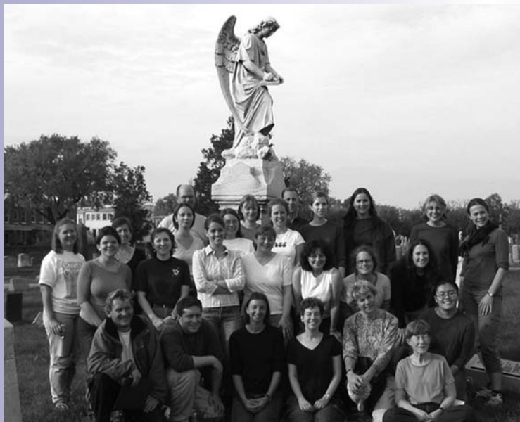
Washington Conservation Guild (WCG) members turned out in force for an FAIC-funded regional angels project at Historic Congressional Cemetery in the District of Columbia.