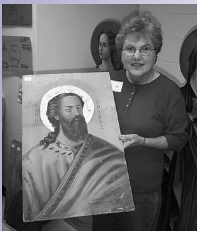
Iconic paintings represented just some of the hundreds of artifacts and books that LACA members helped to inventory, document, re-house, and assess.