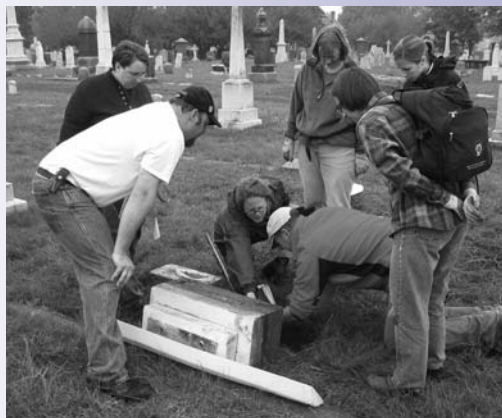
WCG members volunteered to re-set stone memorials at Historic Congressional Cemetery on the weekend of Halloween.