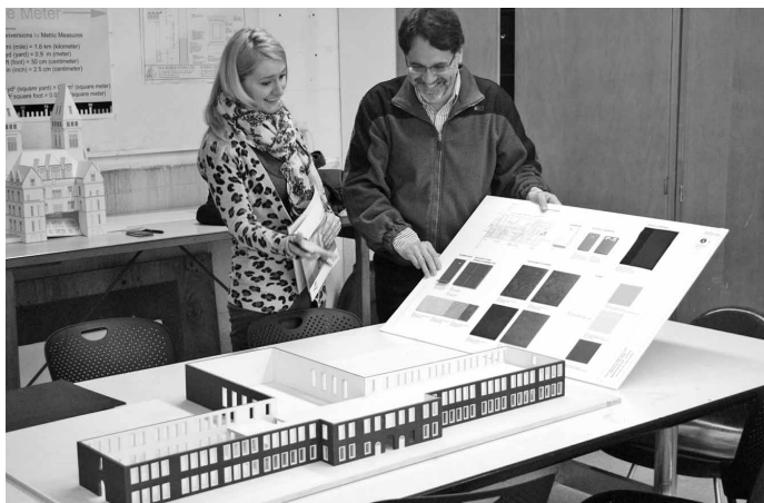
Figure 2: 3D model of the architectural plans.