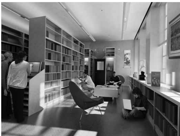
Figure 1: Rendering of the future Conservation Library at Buffalo State courtesy of Architectural Resources

The departmental website will be getting a facelift this summer. The new site will feature a new layout, updated photos, up-to-date construction footage and plans, and new department videos. Videographer and producer Jay Lurie has filmed the department and went on the road to capture several of our alumni on the