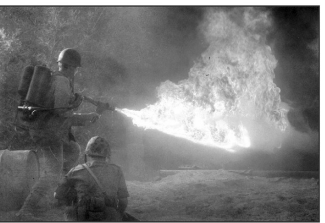
National Museum of the Pacific War - Living History Program