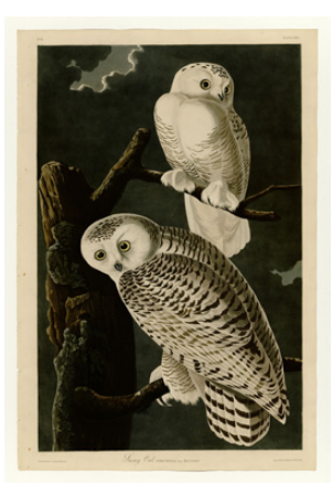
Audobon print Snowy Owl

Join us at History Miami for the Opening Reception. Set on a charming plaza reminiscent of Miami's Spanish past, History Miami gathers, interprets, and presents the history of Miami and the greater South Florida region as a cultural crossroads of the Americas. Through exhibitions, collections, and publications, the museum offers visitors and the community meaningful ways to connect to the rich past and everevolving future of the region and its diverse inhabitants.