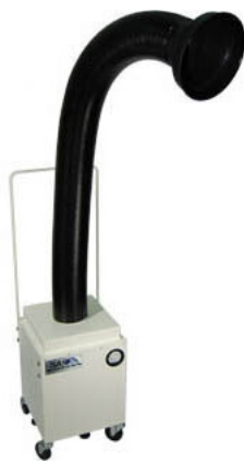
Fig. 4. Sentry Air SS-300-FS

Half of the respondents use their unit with nothing added to building ventilation; 50% monitor the need to change the filter, while the rest follow manufacturer specifications regarding filter change-out schedules.