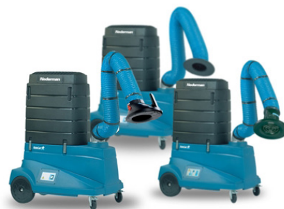
Fig. 2. Nederman Fume Cart

Two respondents had Nederman models: the Fume Cart and the RFE200 PKR. It appears the latter model is no longer available from the manufacturer. When purchasing their extractors, their top three priorities were portability, other costs, and ability to capture specific contaminants.