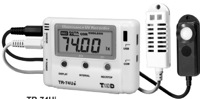
TR-74Ui USB Version

Illuminance . Ultra-Violet . Temperature . Humidity