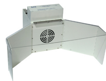
Fig. 3. Sentry Air Winged Sentry with Lid

Two respondents had extractors made by Sentry Air. One was a Winged Sentry with Lid SS-200-WSL (Fig. 3). The other was the SS-300-FS with a single portable arm (Fig. 4). Luke Turner, Sentry Air Technical Representative, indicated that both models have the same motors, but the main difference is their application.