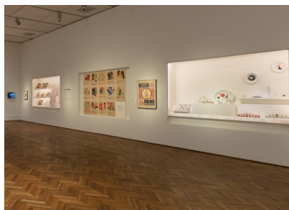
Installation view, Revolutsiia! Demonstratsiia! Soviet Art Put to the Test , on view Oct 29, 2017 – Jan 15, 2018, Art Institute of Chicago.