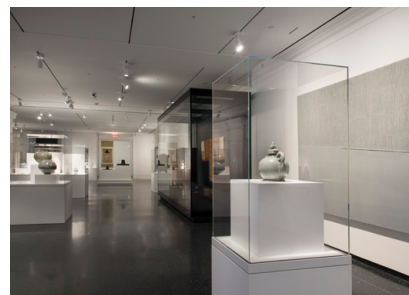
Installation view, Arts of Korea , Brooklyn Museum, on view beginning September 15, 2017.