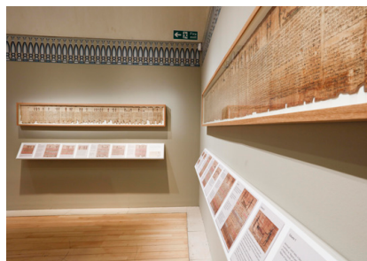
Funerary papi on display in The Tomb exhibition.

For Protection & Display of Cultural Heritage and Fine Art Collections