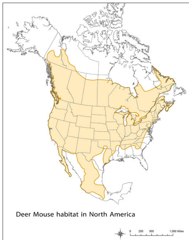
Figure 1. The shaded region of the map shows the deer mouse habitat in North America. The deer mouse prefers woodlands but also appears in desert areas, and is cited as most likely to carry and spread the hantavirus. CDC, https://www.cdc.gov/hantavirus/rodents/index.html .

Since 1993 (and through 2017), the CDC has documented 728 cases of HPS. Scientists identify a correlation between wet conditions that spur abundant vegetation and HPS outbreaks. In the summer and fall of 2012, ten persons who had visited Yosemite National Park became ill with HPS, resulting in three deaths. The common factor was that they had stayed in National Park Service cabins or camped in the vicinity. The previous winter had been moist, yielding an abundance of pine nuts and an abundance of deer mice. The structure of the cabins provided a perfect entry point and space to harbor mice. In 2020, a 24-year-old man living on the mid-Atlantic coast exhibited extreme life-threatening symptoms—fever, fatigue, chills, cough, nausea, vomiting, body pain, and, eventually, respiratory distress. Through a thorough analysis of the patient's activities, he recounted a mouse bite 2 weeks prior. Through tissue sampling the diagnosis was HPS due to a Sin Nombre virus infection.