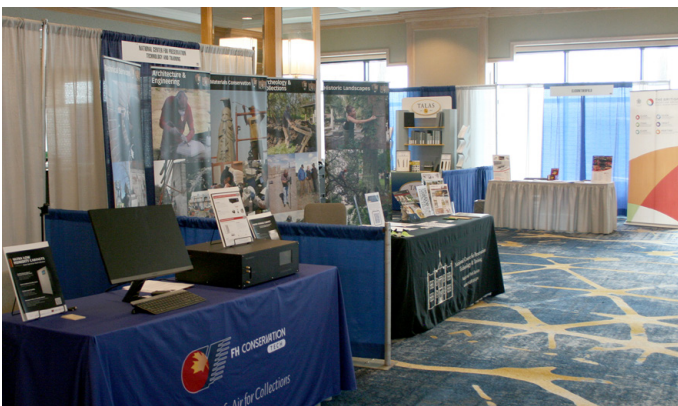
The exhibit hall was full of interesting products, services, and information. The hall extended from a ballroom to the main foyer.

Visit our Upcoming Meeting at https://www.culturalheritage.org/meeting for more information. We regularly post new information to these pages so bookmark and return. The Call for Submissions pages include information about proposing a variety of annual meeting event types.