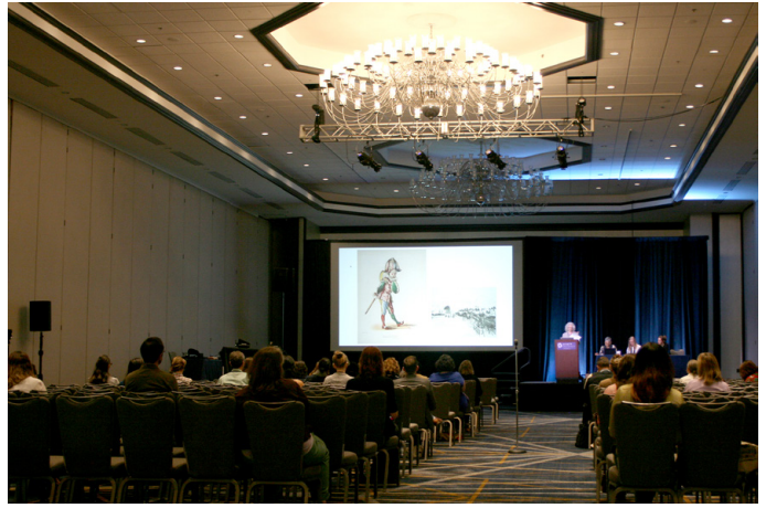
Both in-person and virtual attendees enjoyed many excellent talks.