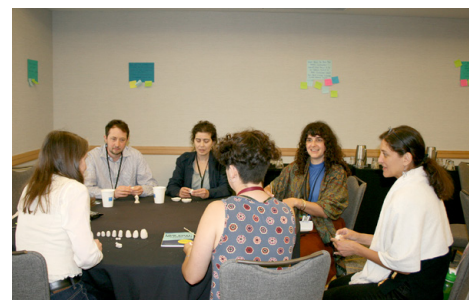
The Breath of Fresh Air room (above and right) allowed dialogue about the climate crisis, and the ECPN Clubhouse (below) offered activities while chatting.