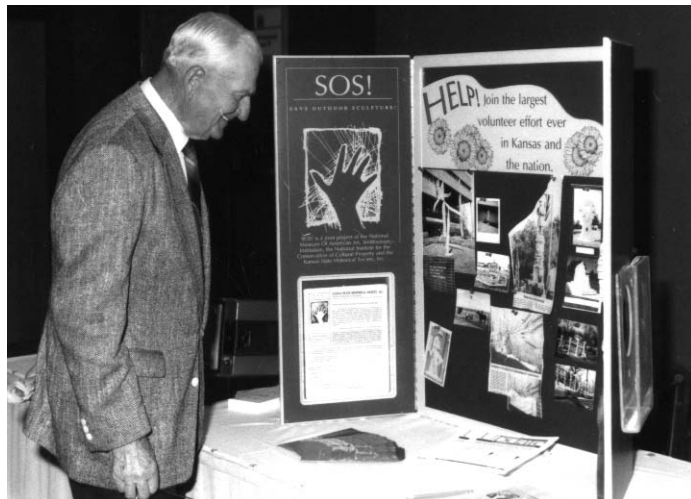
A tabletop exhibit about your SOS! Patch work can be set up in a school, library, shopping mall, or bank. This exhibit by Kansas SOS! is inexpensive, portable, and colorful.

Ask a local reporter for tips on how to spread the word about your town's sculpture and its vulnerability. Using her advice, develop a public-awareness plan that will reach many people in your community.