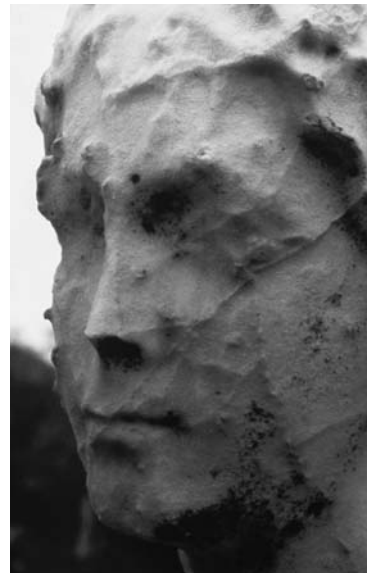
In Pennsylvania, acid rain and weathering are eroding Fame, a 19th-century work by Isaac Bloom.