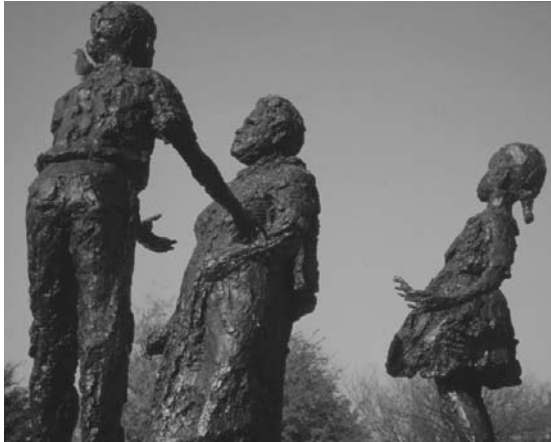
Without words, what do gestures say? Can a picture show what a sculpture means, or if it needs conservation? Mary McLeod Bethune, by Robert Berks (1974), is the first memorial in the nation's capital to both an African American leader and an outstanding woman.

them, and be sure to alert newspaper and television reporters!