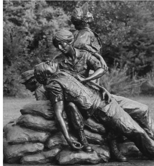
In 1984, a former Army nurse founded the effort to acknowledge the valiant contribution of women who served their country during the Vietnam War. This sculpture is the result.