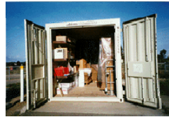
Disaster Response Supplies