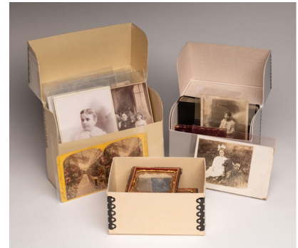
Ideal storage enclosures.