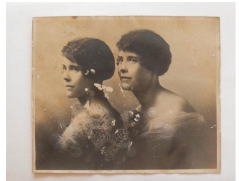
Mold damage on photographs.