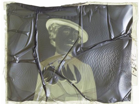
Deteriorating acetate negatives.